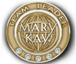
Advancement (You decide when)