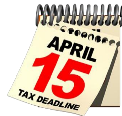
Tax Advantages (Consult a tax professional)