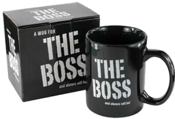
Be Your Own Boss