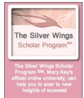
Training & More Training