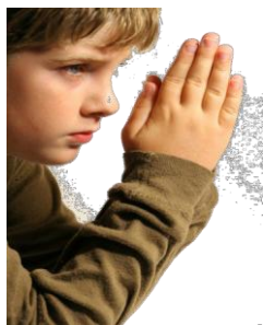
Priorities & Values