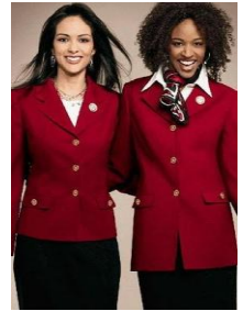
Fun & Friends